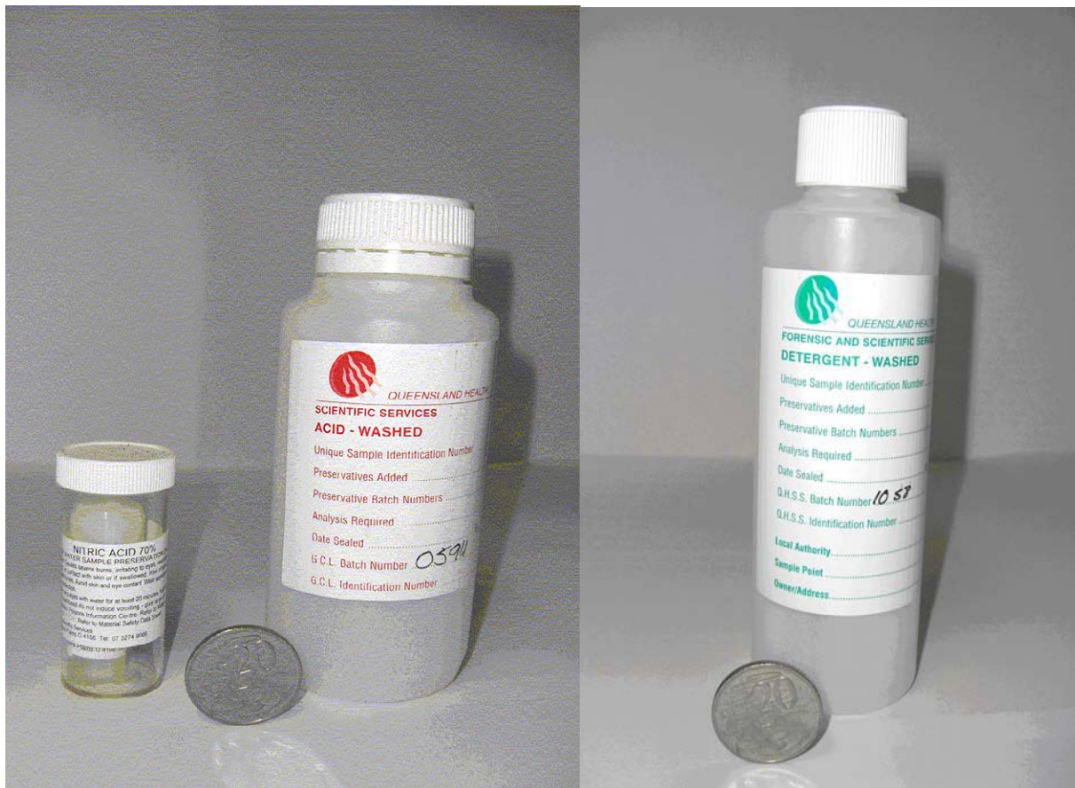
MB/P6 – Red label acid washed plastic 250mL for heavy metals; preservative 2.5mL concentrated nitric acid.