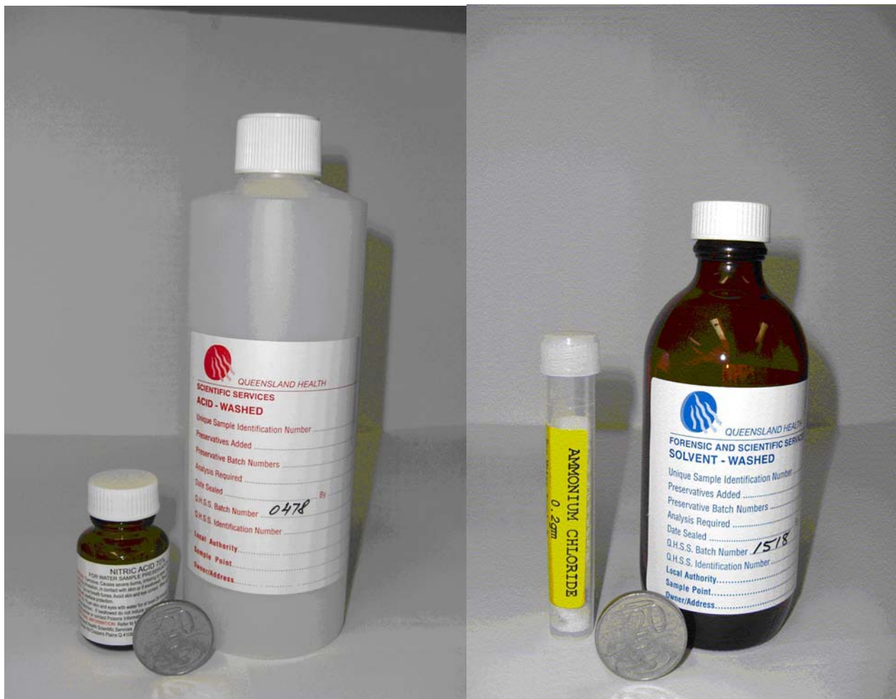
MB/P4 - Red label acid washed plastic 500mL for alpha beta activity, preservative 7.5mL concentrated nitric acid.