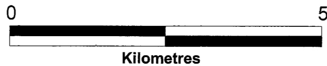
PLAN OF AREA