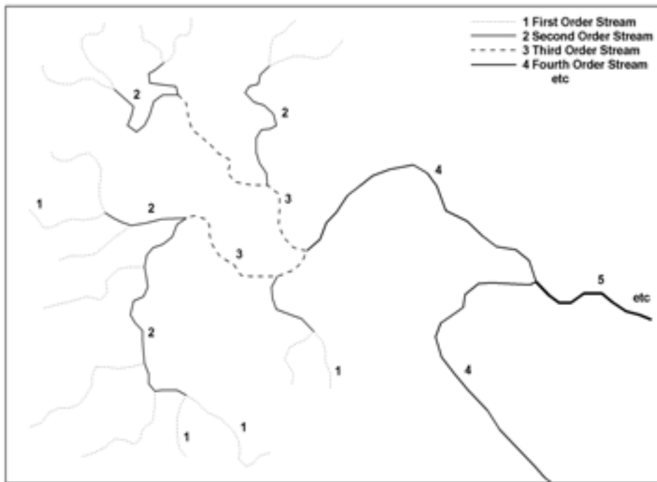
Figure 2: Diagrammatic view of stream ordering