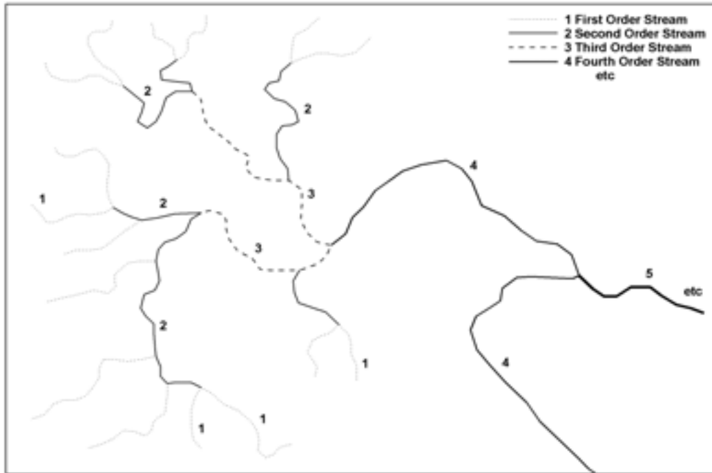
Figure 2: Diagrammatic view of stream ordering