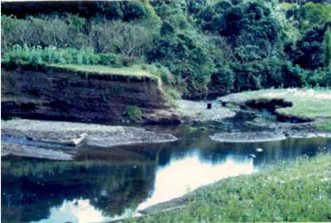
Upstream Site Highly Degraded by loss of Riparian Vegetation - Site 11 Petrie Creek, Menarys Rd.