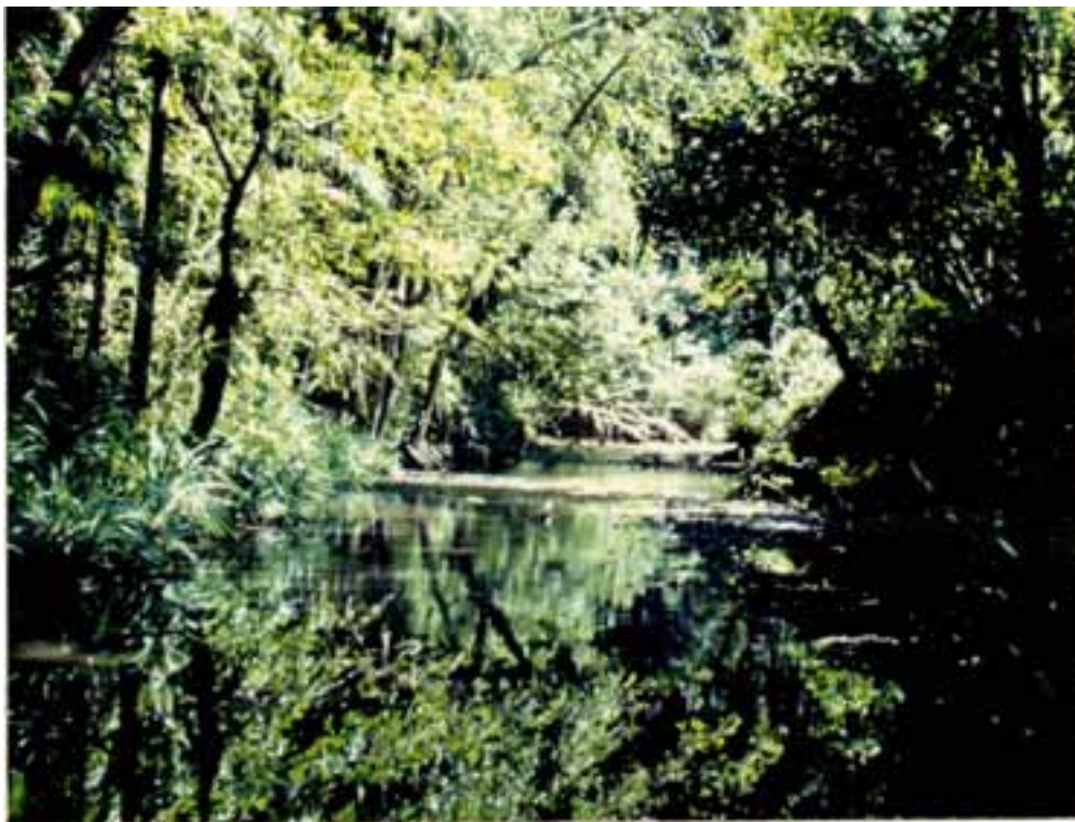
Downstream Site protected from bank erosion by retention of Riparian Vegetation - Site 27 Petrie Creek, about 2 km downstream of Site 11