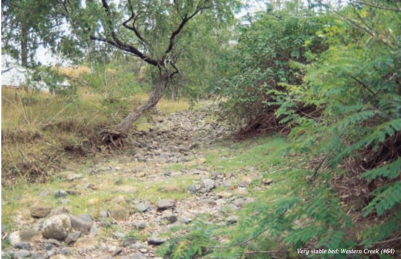
Very stable bed: Western Creek (#64)

Subjective assessments of potential for further degradation (through assessments of instability and susceptibility to erosion) were generally low to minimal throughout the catchment. However, a significant percentage (>20%) of subsections within the Bremer River and Warrill Creek/Lake Moogerah subcatchments was recorded with moderate to high instability. Additionally, the Bremer River, Warrill Creek/Lake Moogerah and Purga Creek subcatchments were identified with moderate to high susceptibility to erosion.