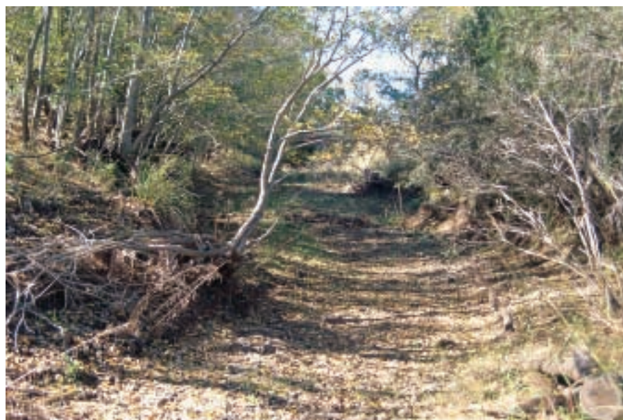
• Moderate bank stability: Bremer River (#47)

Whilst in some cases the occurrence of these processes is consistent with the natural morphology of the streams affected, the occurrence of erosion and slumping in irregular locations and of aggradation all along reach lengths would tend to suggest unnatural damage and disturbance. The most commonly documented bank disturbance factors at sites were damage from grazing activity, flow and wave action, runoff and vegetation removal.