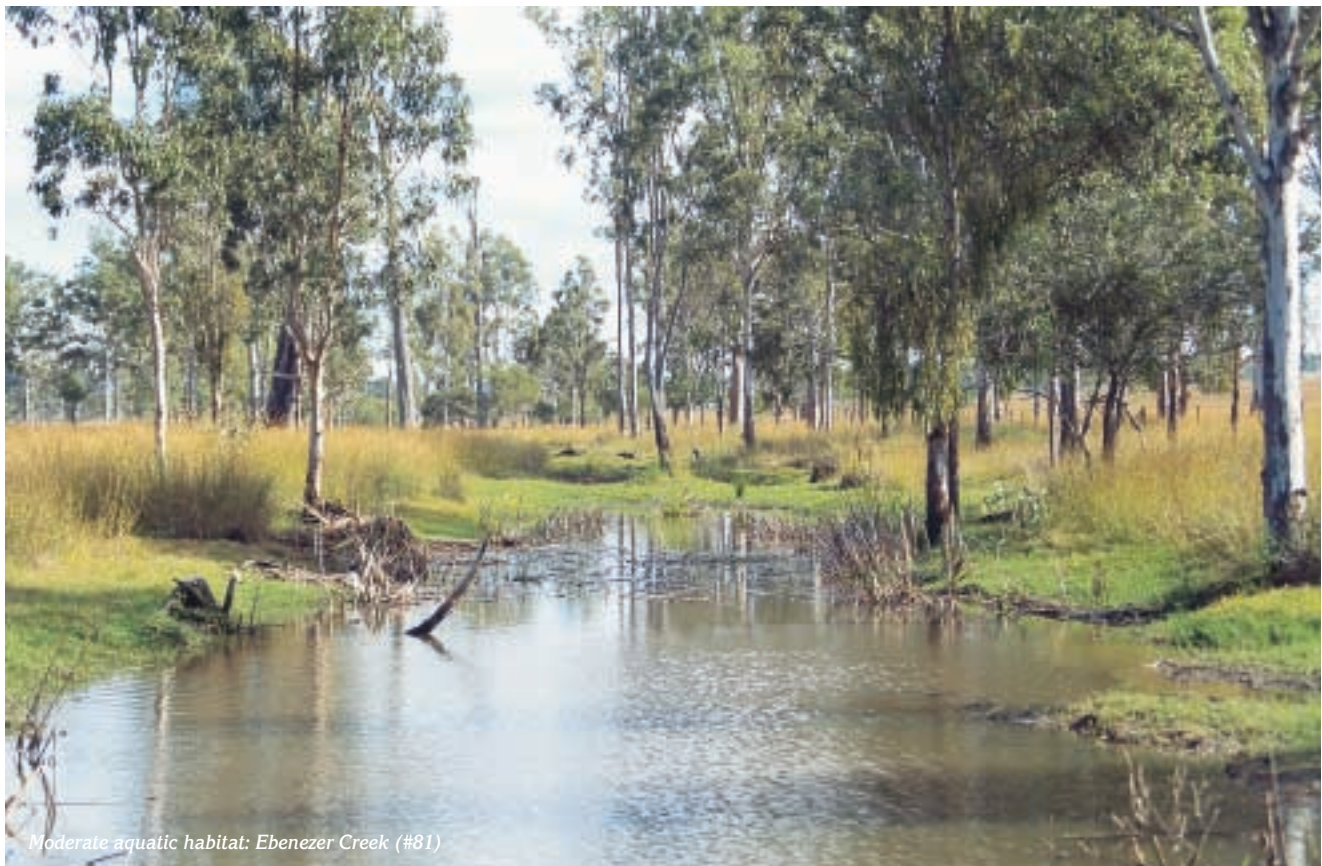
Moderate aquatic habitat: Ebenezer Creek (#81)

Condition ratings for aquatic vegetation within the catchment indicated very low to low abundance at the time of survey (refer Map 8). These results most likely reflect the dry conditions over the region throughout the survey period and the high turbidity of streams that carried water. As a result condition ratings show very poor aquatic vegetation within this catchment. The Bundamba Creek subcatchment recorded the highest levels of aquatic vegetation within the Bremer catchment whilst the Purga Creek subcatchment recorded the lowest levels.