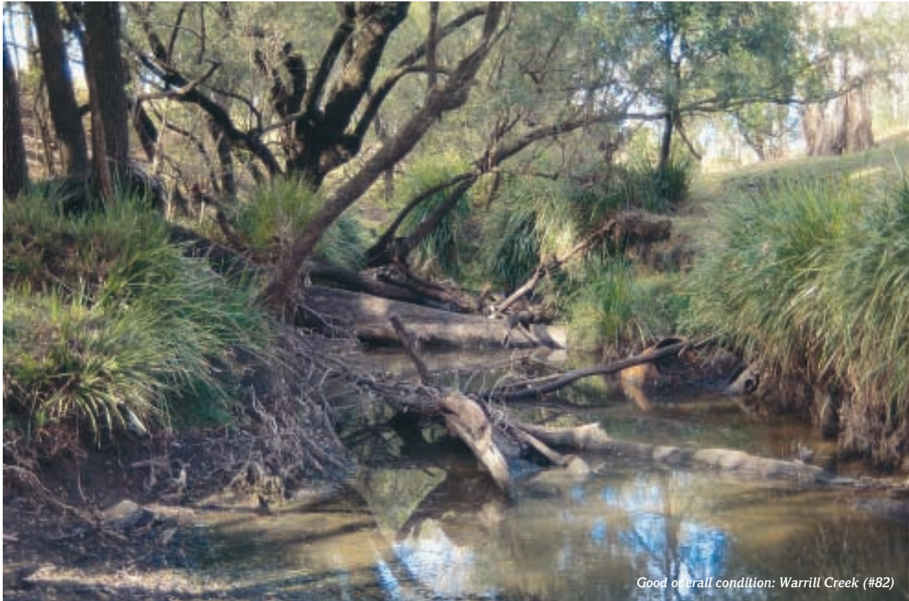
Good overall condition: Warrill Creek (#82)