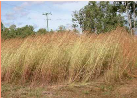
Thatch grass