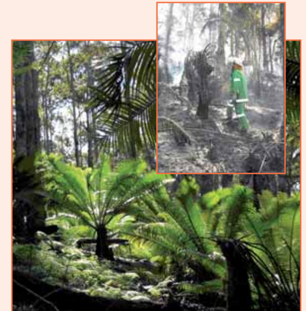
Cycad Lepidozamia peroffskyana

At two key sites, Springbrook Plateau and D'Aguilar Range, QPWS carried out planned burns after many years without fires. The fires removed the majority of the smothering plants, including the lantana, and cleared the cycad trunks of epiphytic plants. No cycads were killed, and soon after the fires the cycads grew new leaf shoots. These results demonstrated that periodic fire is essential for the long-term health of this cycad species and the eucalypt forest community.