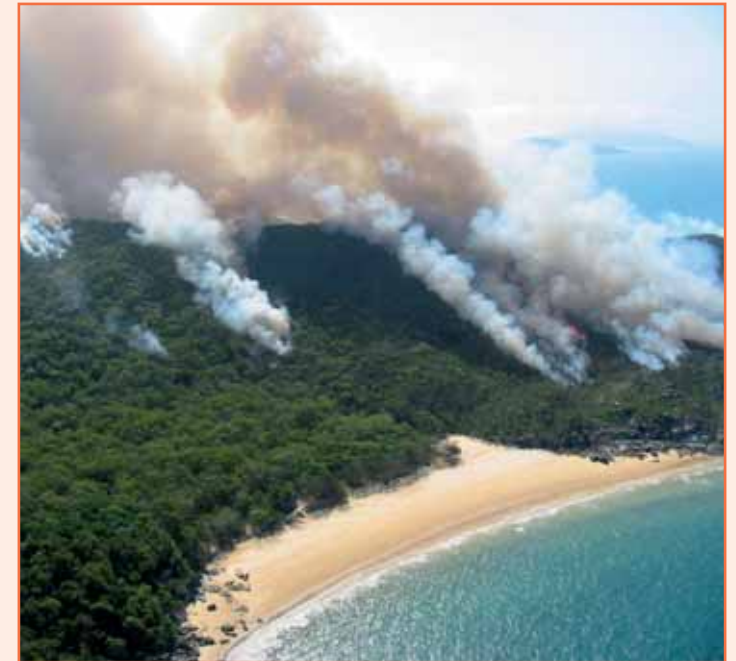
Cape Sandwich

Fire management on island national parks involves an additional level of planning. QPWS also carefully considers factors, such as seabird nesting seasons and limitations on vehicles and equipment that can be transported to the island.