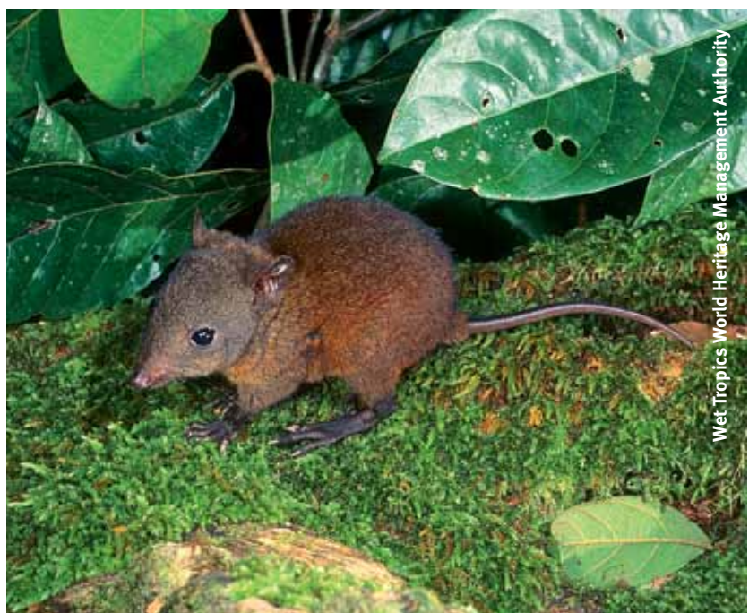
Wet Tropics World Heritage Management Authority