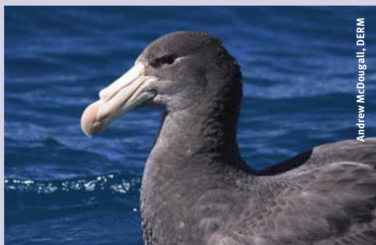
Andrew McDougall, DERM

Queensland's coastal, island and marine environments are the seasonal home for many Australian and international bird species. Birds arrive from as far away as the Arctic and Antarctic regions, Asia, New Zealand and further offshore in the Pacific region. The integrity and resilience of Queensland's coastal and marine habitats is critical, as these areas provide sufficient feeding opportunities for species embarking on their long migrations—often over 10 000 kilometres.