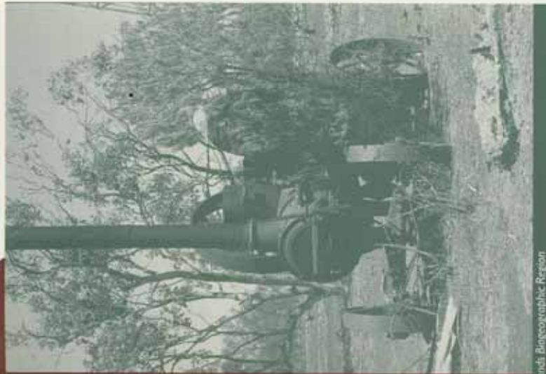
Mulga Lands Biogeographic Region