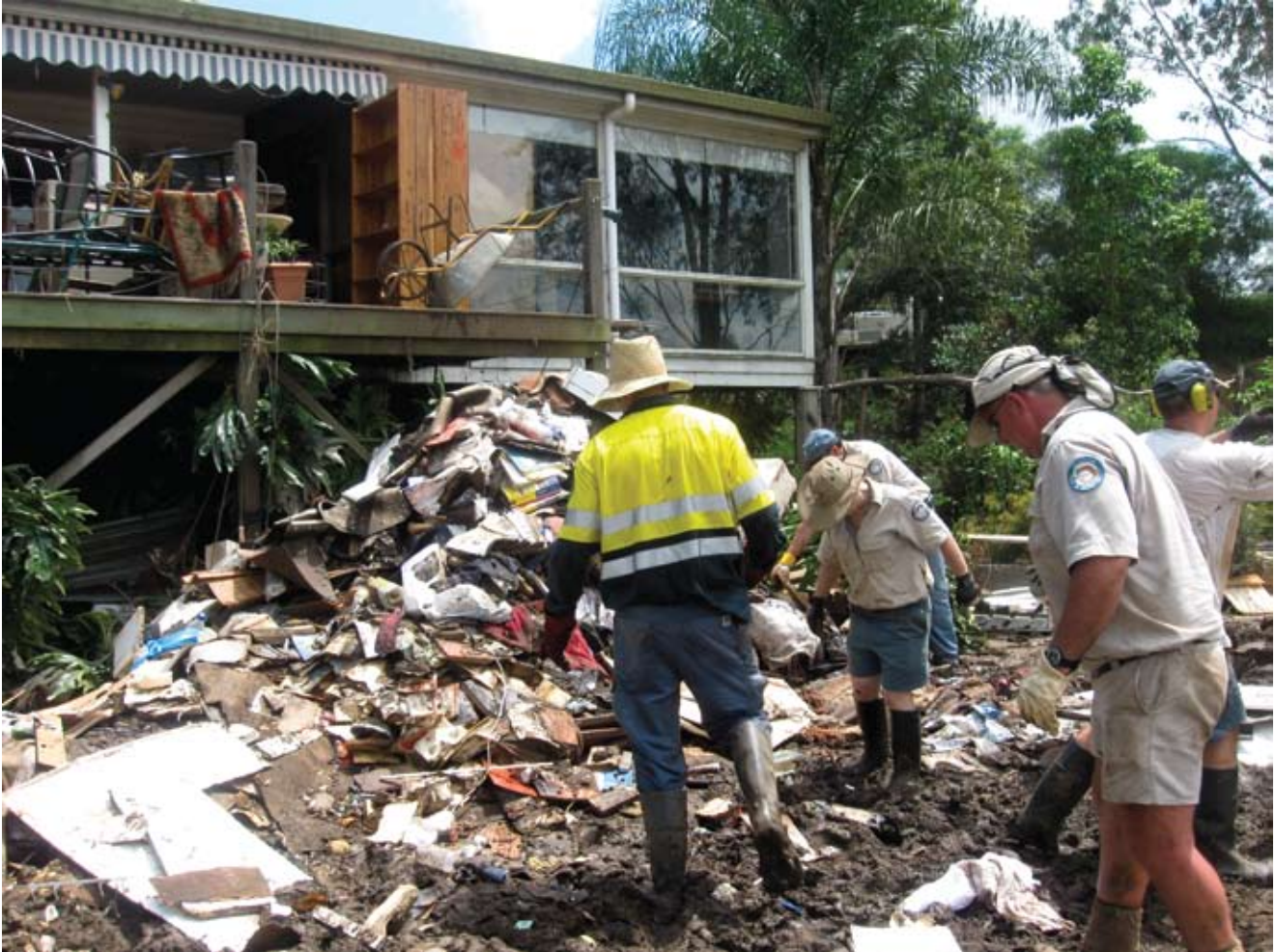
DERM staff join the community in the clean up after the floods