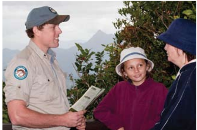
More funding for Queensland Parks and Wildlife Service

The final biodiversity strategy for Queensland will be released in 2011–2012. To support the strategy,