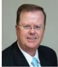
Stephen Robertson MP